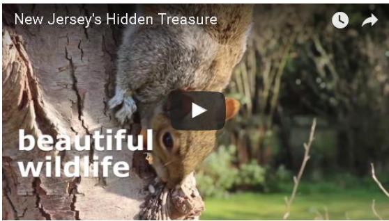
Video 1: New Jersey's Hidden Treasure